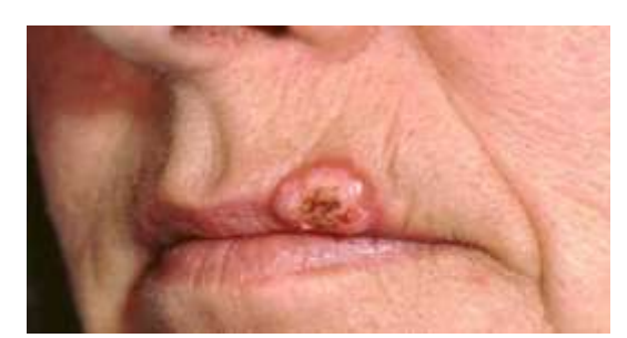
Fig: 1.4 Sore

A raised area or a sore with hard edges on the lips may be a form of skin cancer. Other sores may develop as symptoms of others. Medical conditions, such as oral herpes simplex virus infaction or syphilis still others, such as keratoacanthoma, have no known cause.