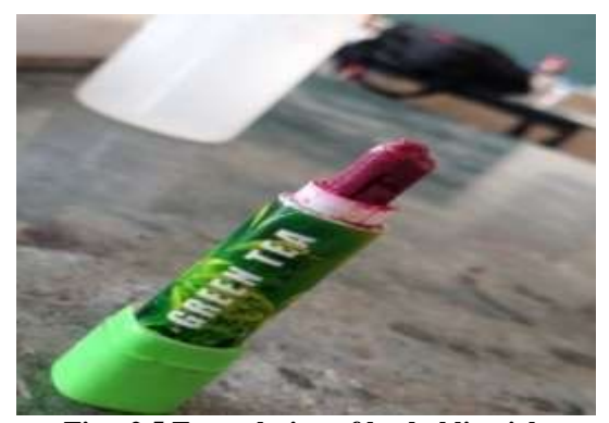
Fig: 2.5 Formulation of herbal lipstick