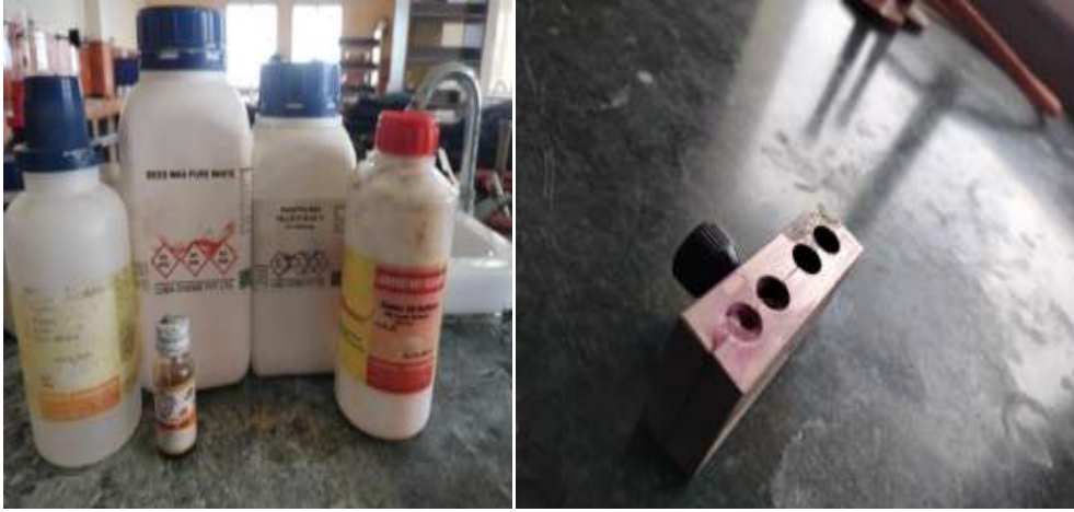
Fig: 2.3 Excipients that use for the formulation

Volume 8, Issue 3 May-June 2023, pp: 1258-1266 www.ijprajournal.com ISSN: 2249-7781