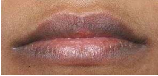
Fig: 1.3 Discoloration

Freckles and irregularly shaped brownish areas (melatonin macules) are common around the lips and may last for many years. These marks re not caused for concern. Multiple, small, scattered brownish-black spots may be a sign of a hereditary disease called peutz-jeghers syndrome, in which polyps from in the stomach and intestines. Kawasaki disease, a disease of unknown cause that usually occurs in infants and children 8 years old or younger, can cause dryness and cracking of the lips nd reddening of the lining of the mouth.