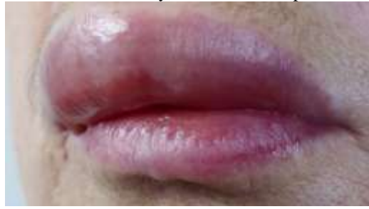
Fig: 1.1 Swelling

An allergic reaction can make the lips swell. The reaction may be caused by sensitivity to certain food or beverages, drug, lipstick, or airborne irritants. When a cause can be identified and then eliminated, the lips usually return to normal but frequently the cause of the swelling remains a mystery. A condition called hereditary angioedema may cause recurring bouts of swelling. Non-hereditary condition such as erythemamultiforme, sunburn, cold and dry weather, or trauma may also cause the lips to swell.